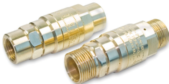
PSL50 and PSL75

RMC's PSL Pressure Limiting Valves regulate the inlet supply line pressure to a preset maximum preventing over-pressure situations. PSL Pressure Limiting Valves are ideal for installation with high pressure storage water heaters, water meter assemblies, water softeners etc.