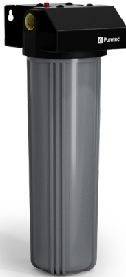
WH1-60 20" Single Water Filter System