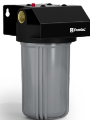
WH1-30 10" Single Water Filter System