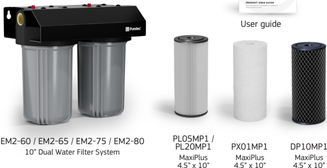
EM2-60 / EM2-65 / EM2-75 / EM2-80 10" Dual Water Filter System