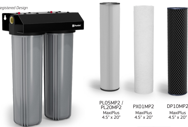
EM2-100 / EM2-110 / EM2-140 / EM2-150 20" Dual Water Filter System